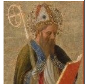
St. Augustine, Fra Angelico (MET)

In his day, Augustine providentially fulfilled the office of prophet. Like Jeremiah and other greats, he was hard-pressed but could not keep quiet. "I say to myself, I will not mention him/I will speak in his name no more/But then it becomes like fire burning in my heart/imprisoned in my bones/I grow weary holding it in/I cannot endure it" (Jeremiah 20:9).