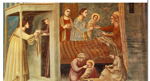
The Birth of the Virgin | fresco by Giotto

Saint Augustine connects Mary's birth with Jesus' saving work. He tells the earth to rejoice and shine forth in the light of her birth. "She is the flower of the field from whom bloomed the precious lily of the valley. Through her birth the nature inherited from our first parents is changed." The opening prayer at Mass speaks of the birth of Mary's Son as the dawn of our salvation, and asks for an increase of peace.