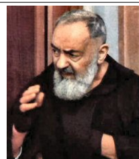
Padre Pio, priest

Today is the Memorial of St. Pius of Pietrelcina (1887-1968), more popularly known as Padre Pio was born in 1887 in the small Italian village of Pietrelcina. He joined the Capuchin Friars at the age of sixteen and was ordained a priest seven years later. For fifty years at the monastery of San Giovanni Rotondo he was a much sought after spiritual advisor, confessor, and intercessor whose life was devoted to the Eucharist and prayer. Yet despite such notoriety, he would often say, "I only want to be a poor friar who prays."