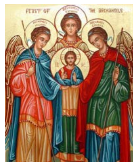
Sts Michael, Gabriel, Raphael, archangels

The liturgy celebrates the Feast of Saints Michael, Gabriel and Raphael, archangels who are venerated in the tradition of the Church. Michael ( Who is like God? ) was the archangel who fought against Satan and all his evil angels, defending all the friends of God. He is the protector of all humanity from the snares of the devil. Gabriel ( Strength of God ) announced to Zachariah the forthcoming birth of John the Baptist, and to Mary, the birth of Jesus. His greeting to the Virgin, "Hail, full of grace," is one of the most familiar and frequent prayers of the Christian people. Raphael ( Medicine of God ) is the archangel who took care of Tobias on his journey.