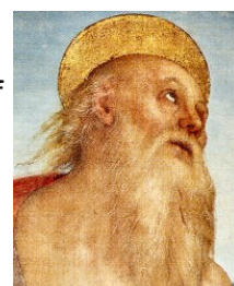
St Jerome, priest, doctor.

Today is the Memorial of St. Jerome (345-420) . Jerome was born in Dalmatia of a Christian, was baptized in Rome, while taking his classical courses. He then studied under the best masters in foreign cities. But the Church had need of this extraordinarily gifted man. Jerome heard and obeyed the divine call, made a vow of celibacy, and withdrew for four years to a hermitage in the Syrian desert. The Holy Father soon summoned Jerome to Rome and entrusted him with the enormous task of revising the Latin Bible. This work, which took 30 years to complete, is the Vulgate version of the Scriptures. He also wrote many other works, mostly commentaries on the books of the Bible.